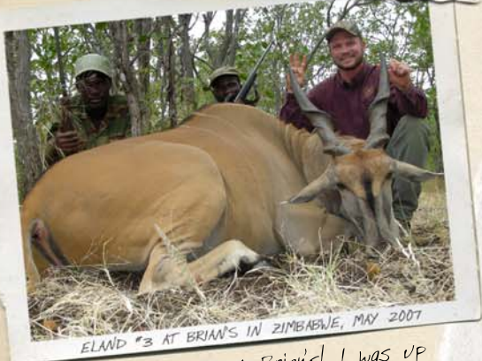
ELAND #3 AT BRIAN'S IN ZIMBABWE, MAY 2007

Crane hunting was a success as usual with Savage around! He's my bird hunting MACHINE!