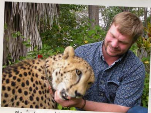
Me and my old pal Dingwe, in Zimbabwe.

I headed back to Alaska in August to help Scrote guide a hunt. ↘ Great sheep JJ!